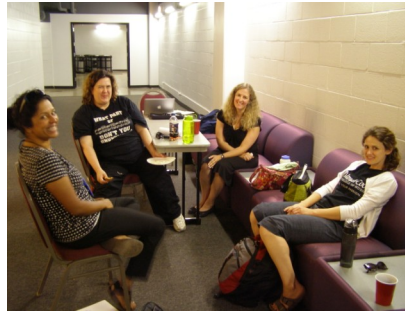
Training teachers enjoy their lunches